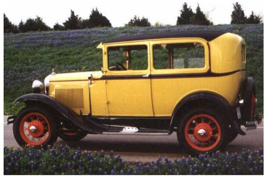
1930 Ford "A" Tudor Sedan